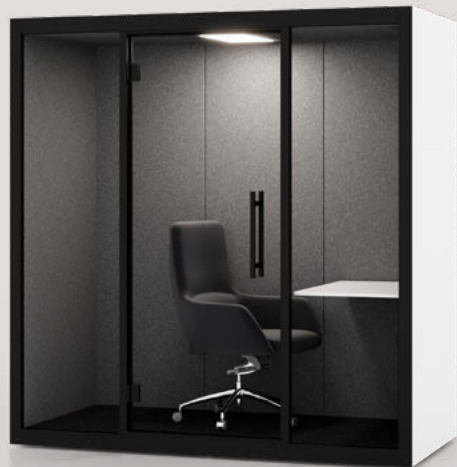
Table Height adjustable table with white antibacterial laminate Power outlets Additional 110-240 V power outlet on the wall Screen bracket universal bracket with cable management (optional)

Workstation Turn privacy into productivity with Duo Workstation